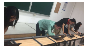
Fig 5. Student survey

All students participated to an anonymous online survey. The results show that the collaboration between the software and hardware modules is highly praised by the students. The 3-stage feedbacks greatly helped the students on completing the project.