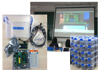
Fig 1. The hardware kits and hands-on workshop