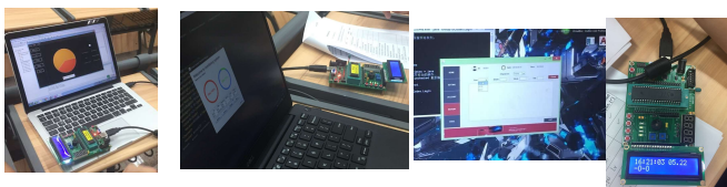
Fig 4. Group demonstration 2018: A smart energy management and monitoring system