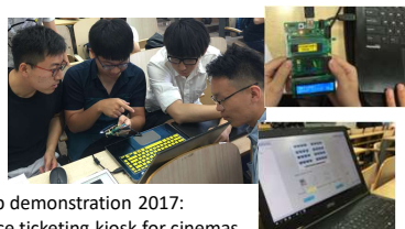
Fig 3. Group demonstration 2017: A self-service ticketing kiosk for cinemas