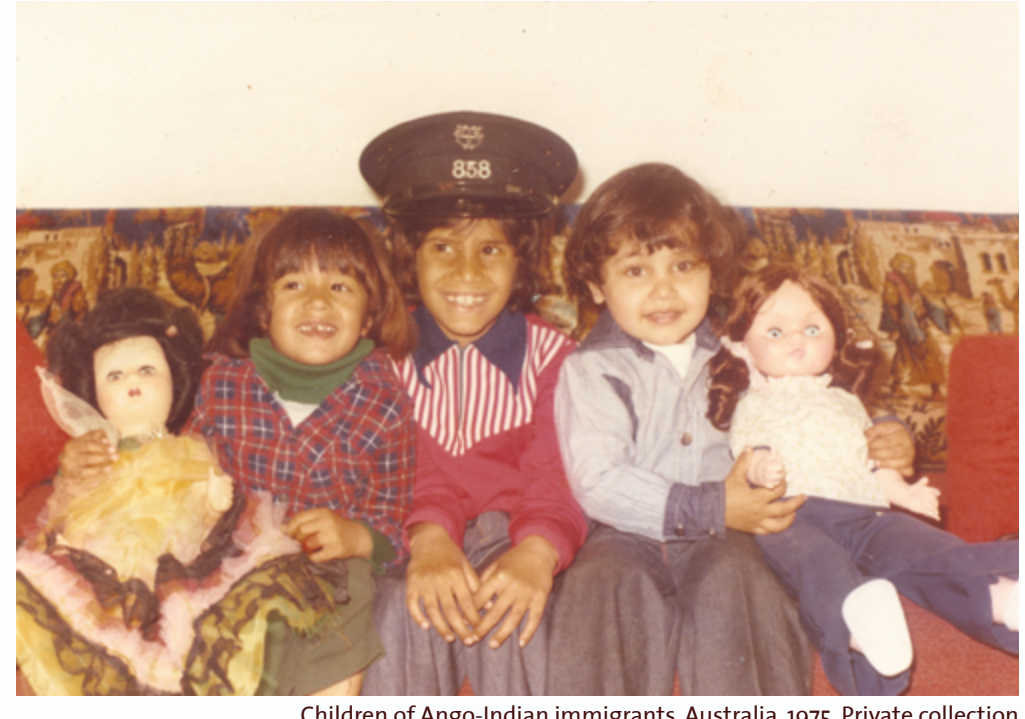
Children of Ango-Indian immigrants, Australia, 1975.

This conference will explore the ways in which children imagine, understand and engage with the wider world.