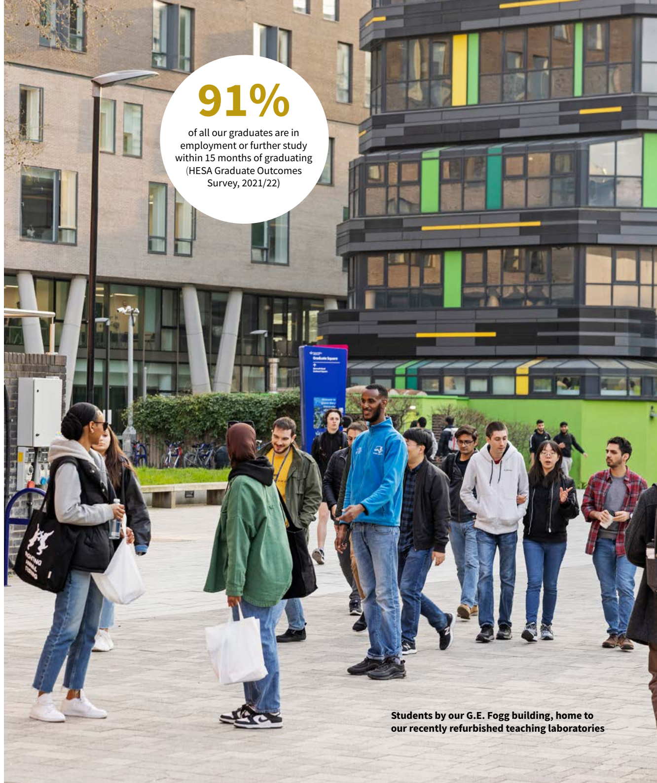
Students by our G.E. Fogg building, home to our recently refurbished teaching laboratories

of all our graduates are in employment or further study within 15 months of graduating (HESA Graduate Outcomes Survey, 2021/22)