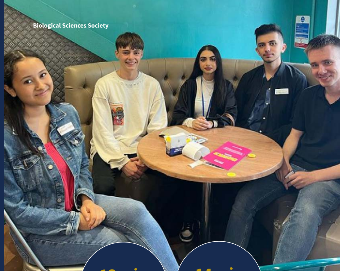
Biological Sciences Society